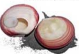
Sybaritic sea shell scrub at BLISS SPA