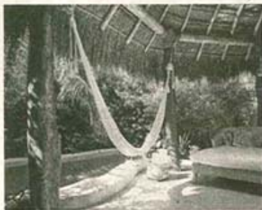
The retreat package includes six nights in a luxury villa, with a plunge pool.